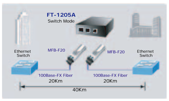
Fiber Switch mode - distance extension