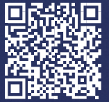
TCR100 360° VIEW