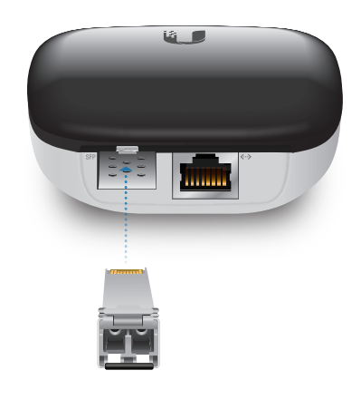
Insert a compatible active fiber SFP module. (UFiber module, model UF-MM-1G shown)