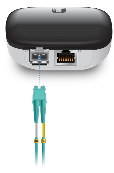
Connect a fiber optic cable. (UFiber ODN cable, model UOC-5 shown)