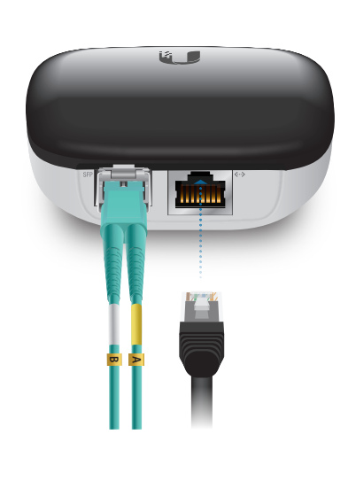
Connect an Ethernet cable from a device delivering PoE to the UF-AE.