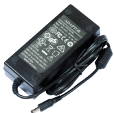
24V 2.5 A power adapter