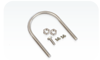
K-70 fastening set