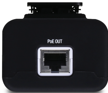
PoE Out Port

Rubber Case Clip Use the clip on the back of the rubber casing to secure the U-Installer to a belt or pocket.