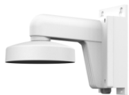
DS-1273ZJ-130B Wall Mount with junction box