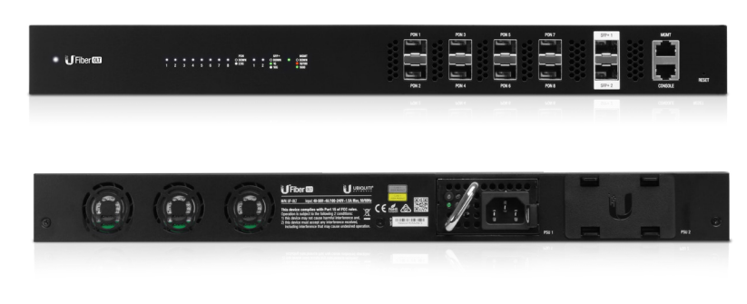
AC/DC Power Module

For out-of-band management, the UF-OLT offers a Gigabit Ethernet port. For Command Line Interface (CLI) management, an RJ45 serial console port is available.